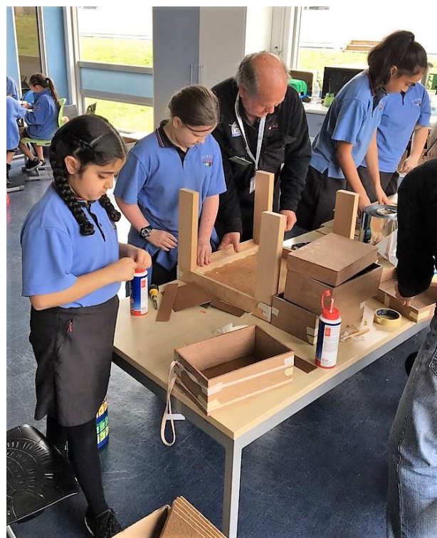
Stonefields school kit-set assembly

The official opening of the new car park is imminent and should take place within the next couple of weeks. Hopefully it will be on a planned working day and the publicity will bring a number of visitors to the Shed.