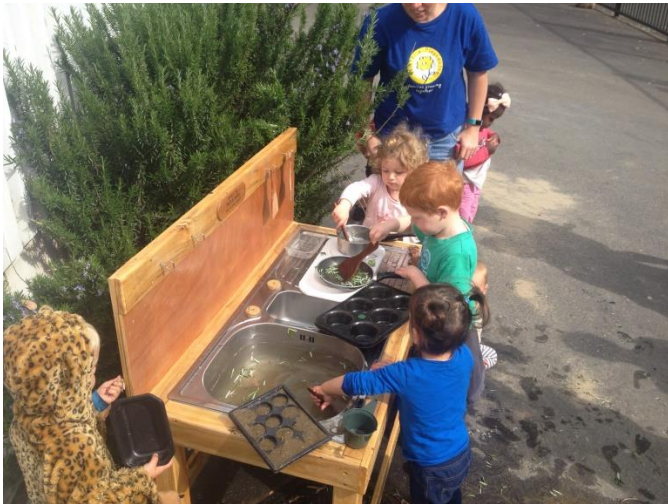
Mud kitchen for Ellerslie Play Centre.

There have been a large variety of community projects go through the Shed since the last newsletter. All those involved are entitled to a well-deserved vote of thanks, your efforts are very much appreciated by the various recipients of the projects.