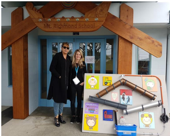
Water wall for Mt. Richmond special school