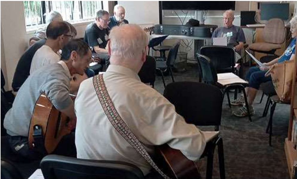
The Shed singers get ready for Family Day

A chance to show the people at home, what we do at the shed. (Tea and coffee served, biscuits and cake welcome.)