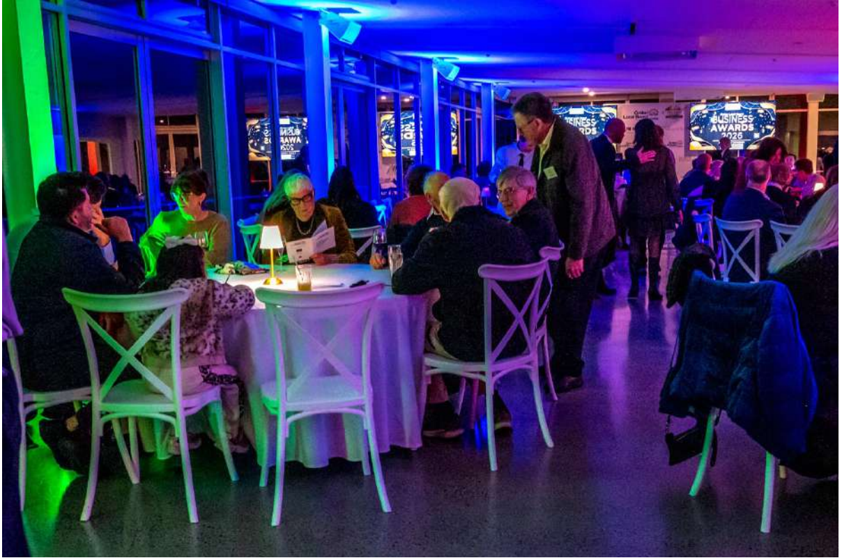
All the contestants enjoying the event.