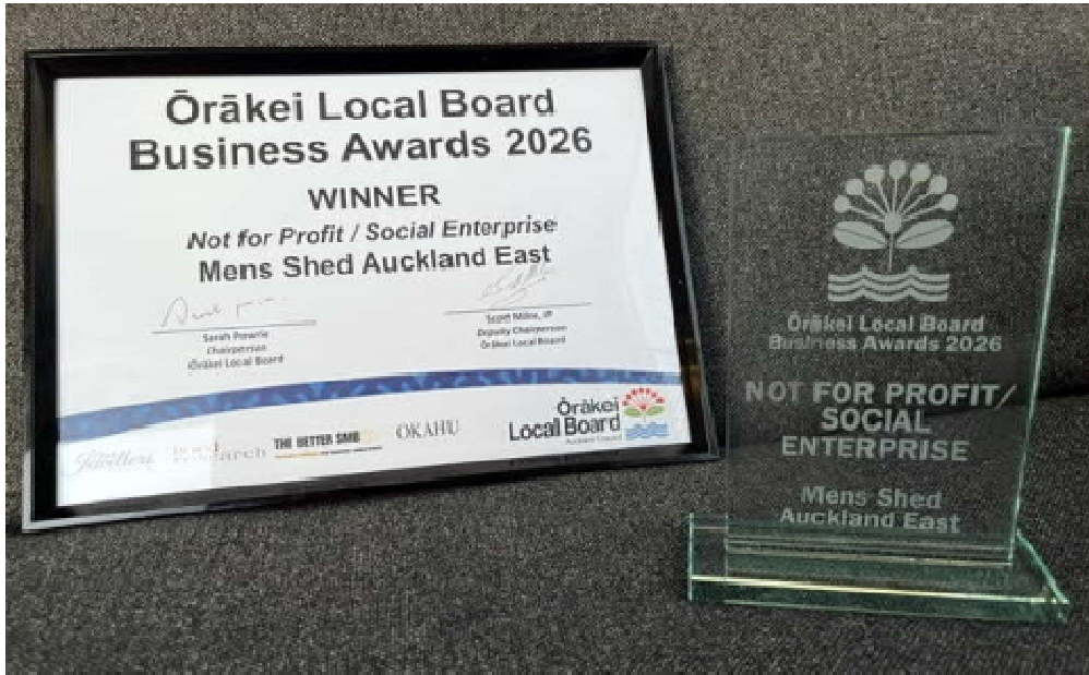
The Award and Certificate