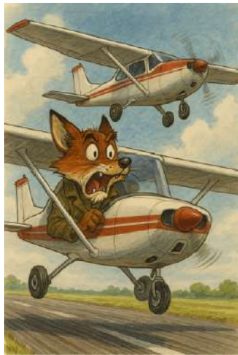
Mal McLennan scared us with a near collision, when learning to fly.