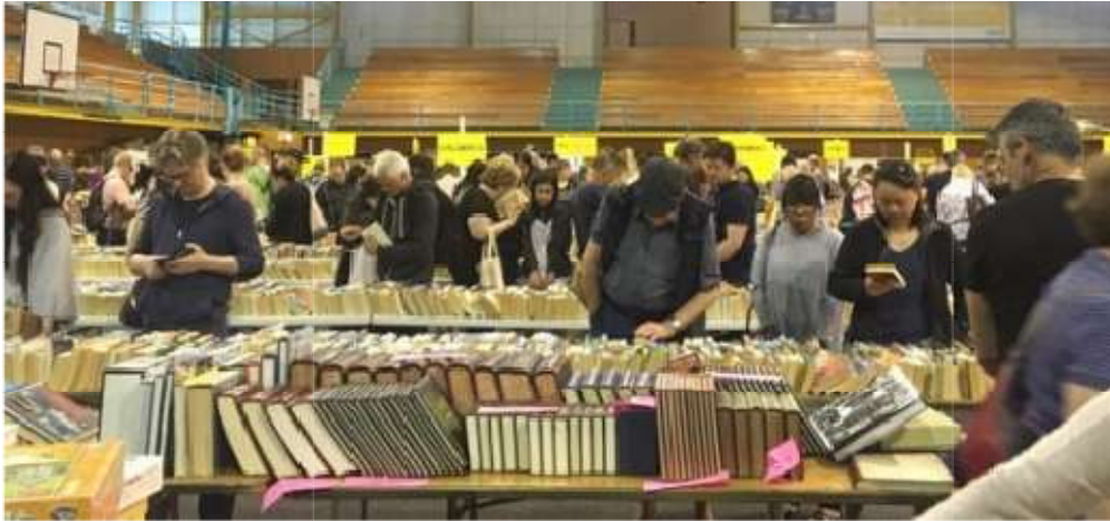
The Great Eastern Book Fair was manned by some of our members.