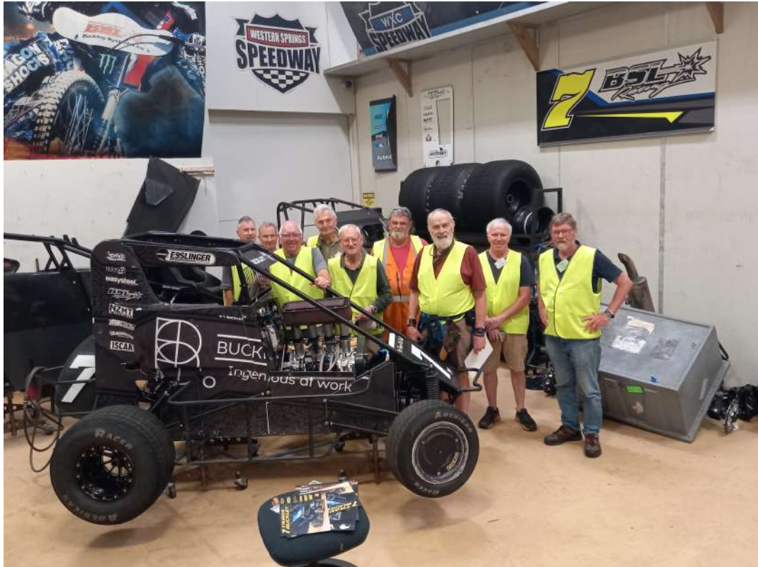
A bunch of Sheddies did a factory visit to Buckley Engineering and saw their Race Cars being built.