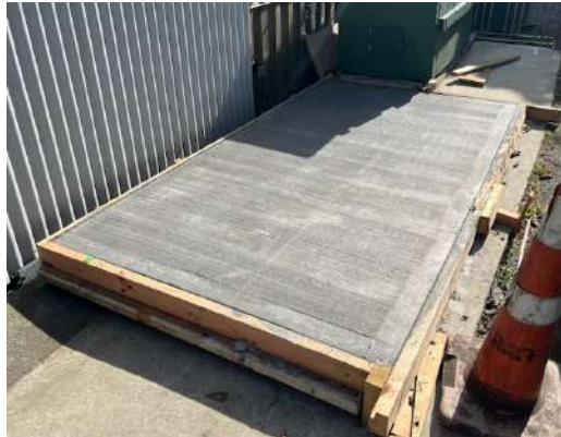
A Concrete slab was poured, ready for our new dust extraction system