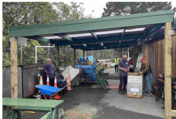
Our new canopy got built and was quickly put to use.