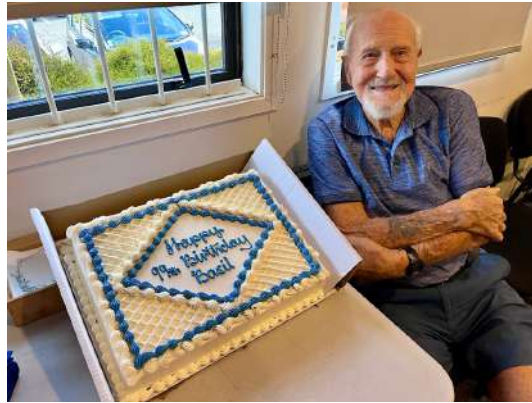
We celebrated our oldest member's 99th birthday!