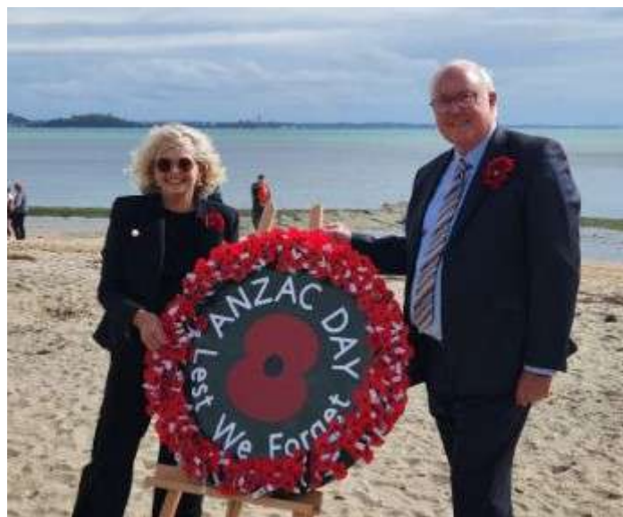
We built a Stunning plaque to hold individual "Poppies" at the Anzac Day celebrations at St Heliers.