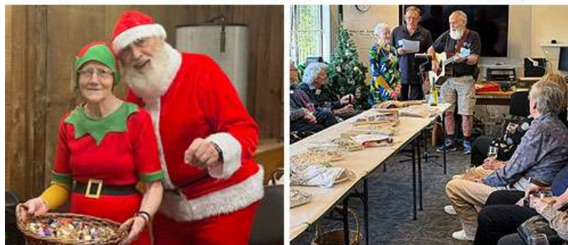
Partners night was a great success, even Santa and his helper turned up with tasty treats.