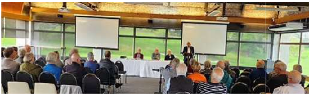
We held a retirement Village Seminar at the Remuera Golf Club. This was a great success with 42 Shed members, partners and friends in attendance.