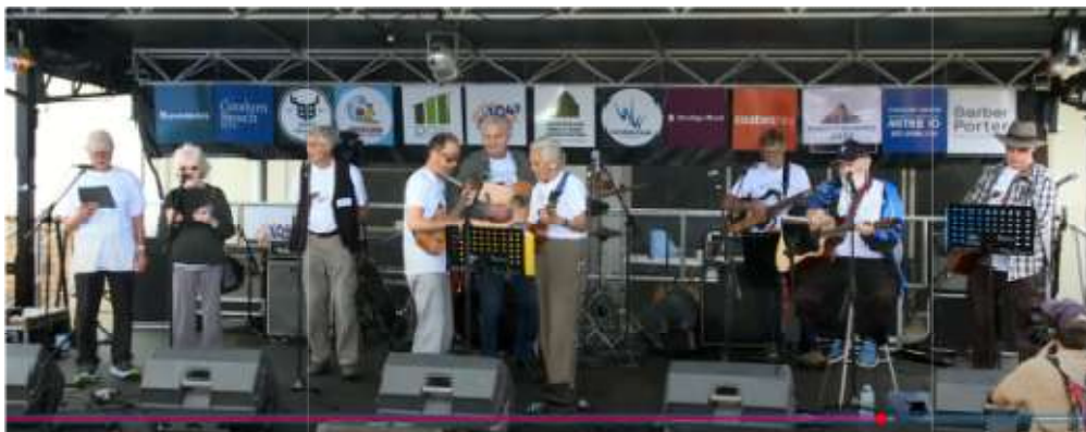
Our Music Group sang and played at the Coolum Mens Shed Music Festival, on the Sunshine Coast in Australia.