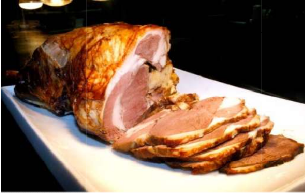
Bernie Ward cooked up a traditional "Colonial Goose" that was rapidly devoured by Sheddies on the day.