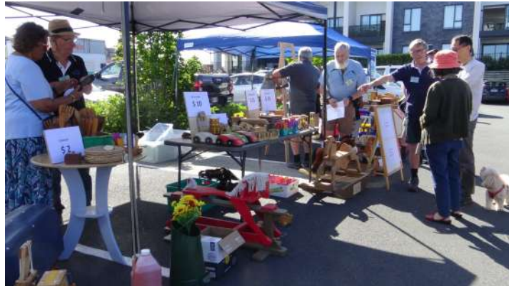
Lots of "stuff" was sold at the Stonefields Market day.