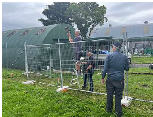
Preparations have been made for the new storage shed . The removal of some top soil will take place to prepare for the storage building and mechanical workshop extensions as stages 3 & 4 of the extension projects.