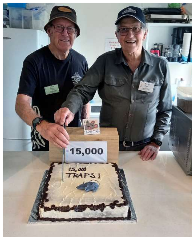
We celebrated our 15,000th Trap built.