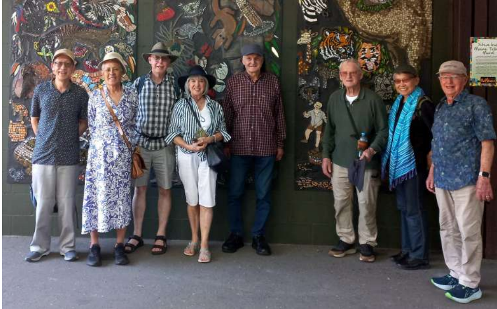
While in Australia, a group of our Sheddies visited Steve Irwin's "Australia Zoo"