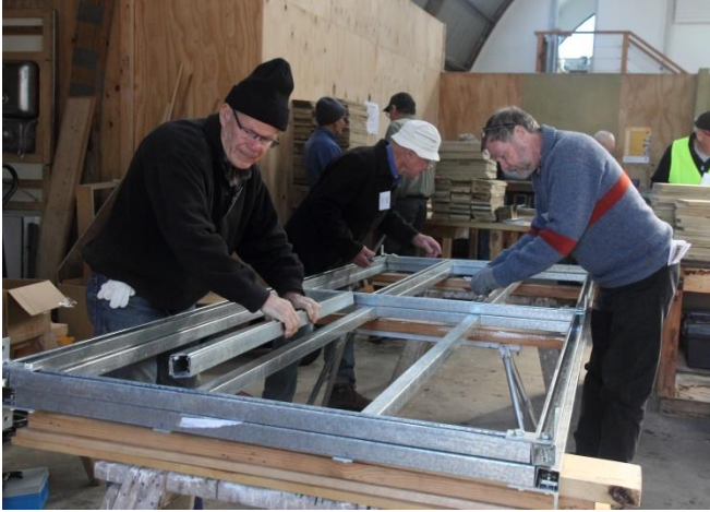
Trees for Survival frame assembly

We continue to have good member attendance on our operating days. We have been averaging 25 on Tuesdays and 35 on Fridays. These figures are extracted from the signing in sheets which provide data for a number of purposes as well as satisfying Health & Safety requirements. By the way it helps if you remember to sign out as it saves the Duty Manager searching under benches for missing bodies.