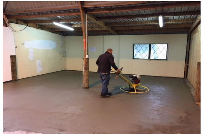
New concrete floor going in

To be eligible to vote you had to be a financial member at 31 July 2018.