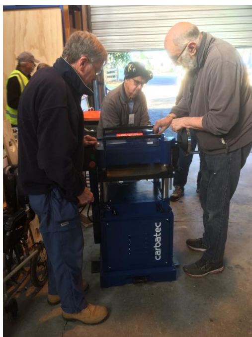
New thicknesser being assembled

Look out for your official AGM notification.