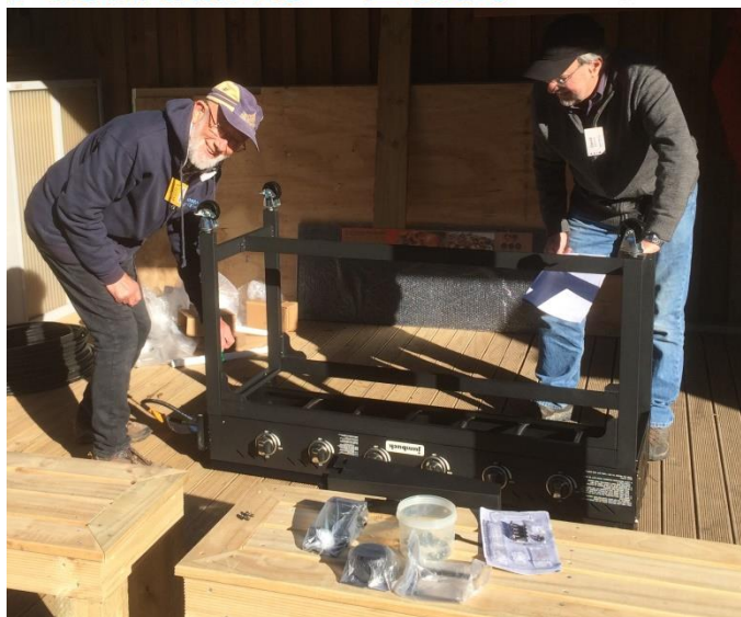
The new BBQ being assembled 2 July