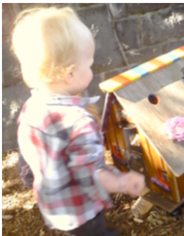
Kids loved Barry McNutt's fairy house

At the Panmure Toddlers Day out we borrowed an idea from Massey Mens Shed and made wooden toy car components, which young kids assembled with a screw driver, decorated, then raced down a ramp. It was such a success that all 100 cars were gone after only 45 minutes of the 3 hour session.