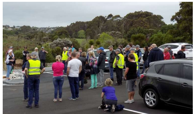
New car park opening Nov 17

The Shed was open for interested people to look around and it was very pleasing to see the amount of interest shown by our local politicians in our transformation of the old shed and to receive their favorable comments. We also had a number of interested potential members give the Shed a good inspection most of whom signed up on the day or took application forms home.