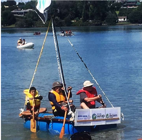
Panmure Raft race 2018