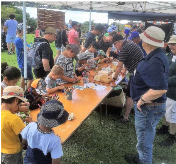
Panmure fun day 2018

This year's raft is at the design stage with construction to commence shortly. Last year we came 2 nd so this year we are out to win. If you are interested in being involved contact Terry Moore 021 082 90970