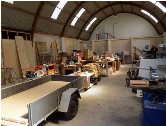
The extended workshop with the new walls in place.

The New Year is already shaping up to be as busy as last year with further improvements to the shed, outside activities and a steady stream of new requests for projects from local community organisations. Add on your own personal projects and I think this year will just fly by.