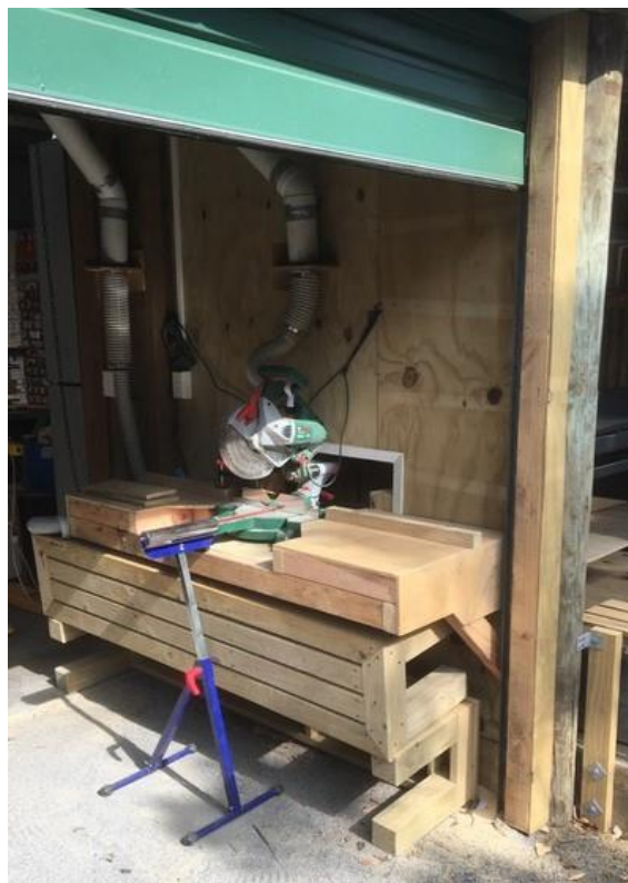
New drop saw work space

A new drop saw work space has been custom built by the New East roller door