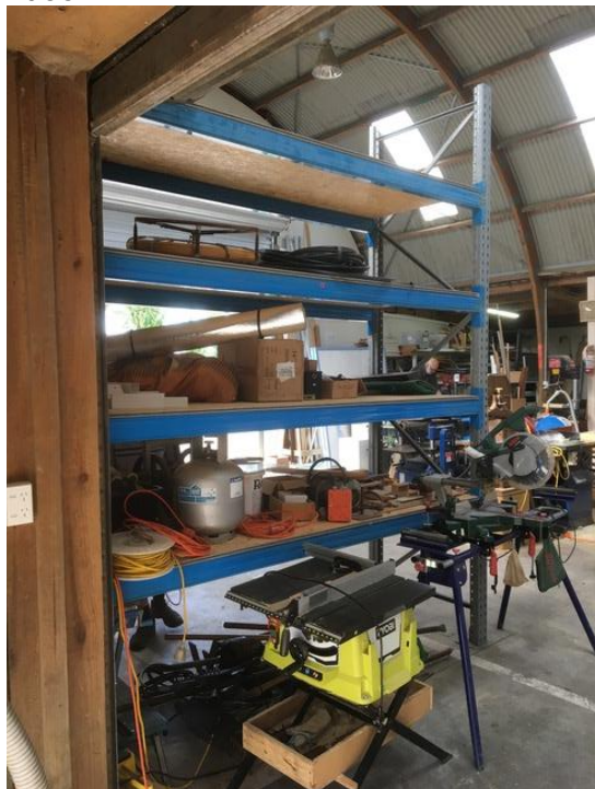
New shelving in place.

Alan and Mal have scored some great steel shelving and have already erected one unit adjacent to the East side roller door.