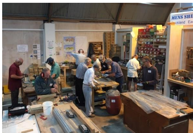
10 shed members busy on Rat Trap production.

An order for 600 rat traps from the Pest Free Howick group has been met with enthusiasm by members with the order well on the way to being filled.