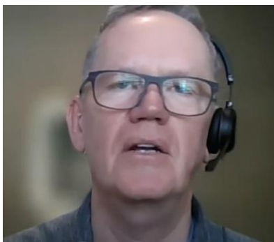
Jim Stabback, ( CEO of Auckland Council )

fascinating story to tell about new discoveries to treat and manage cardiovascular disease. Focusing on hypertension (high blood pressure), ways to treat it, a new heart pacemaker and how we are using 3-D printing to research rheumatic heart disease.