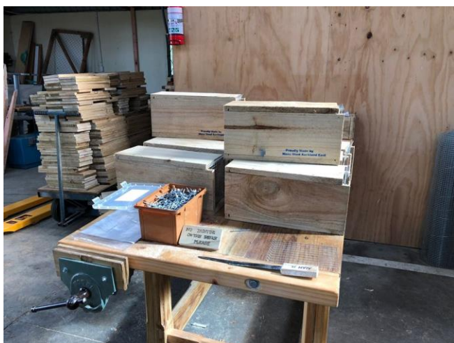
Rat trap production Project 1003

Membership fees are $23.00 including GST.