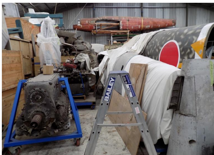
Restoration work piling up.

A public open day is being planned for 30 th November . We will have invited guests in the morning followed by the general public later on. Keep this day in mind and look out for more information towards the end of the month.