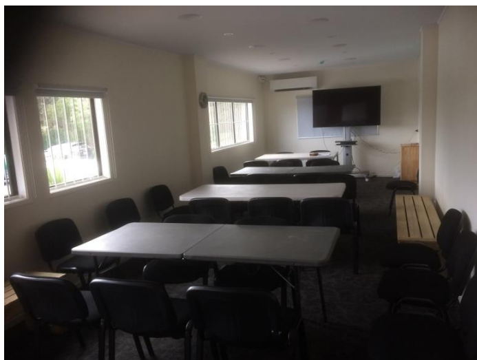
Our new meeting room ready for action.