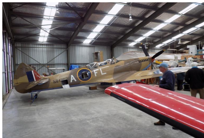
Restoration nearing completion.

20 members of the shed visited Ardmore to take a look at some old aircraft undergoing restoration and examples of the finished items. The quality of the work being performed in quite basic facilities is a credit to the skill and enthusiasm of the technicians performing the work.